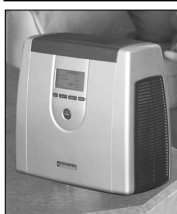
The EdenPURE® Area Model